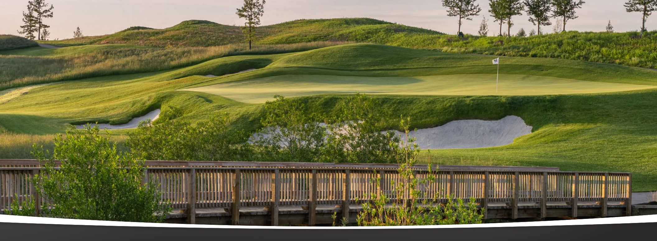
Mickelson National Golf Club... when only the best will do